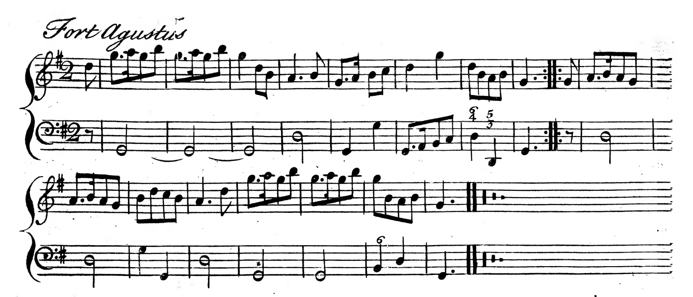
First Cu. foot it & cast off into the 2<sup>d</sup> Couple's Place, then foot it & cast off into the 3<sup>d</sup> Couple's Place, Then lead up to the Top & cast off into the 2<sup>d</sup> Couple's Place, then RightHand & left quite round.